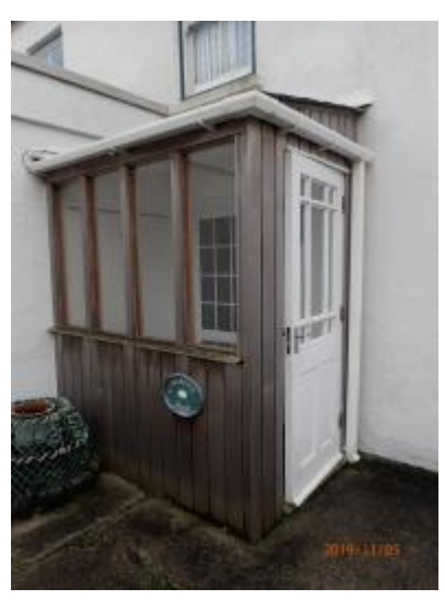
Clarence House Entrance