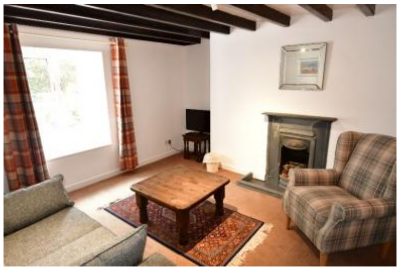
Clarence House Snug