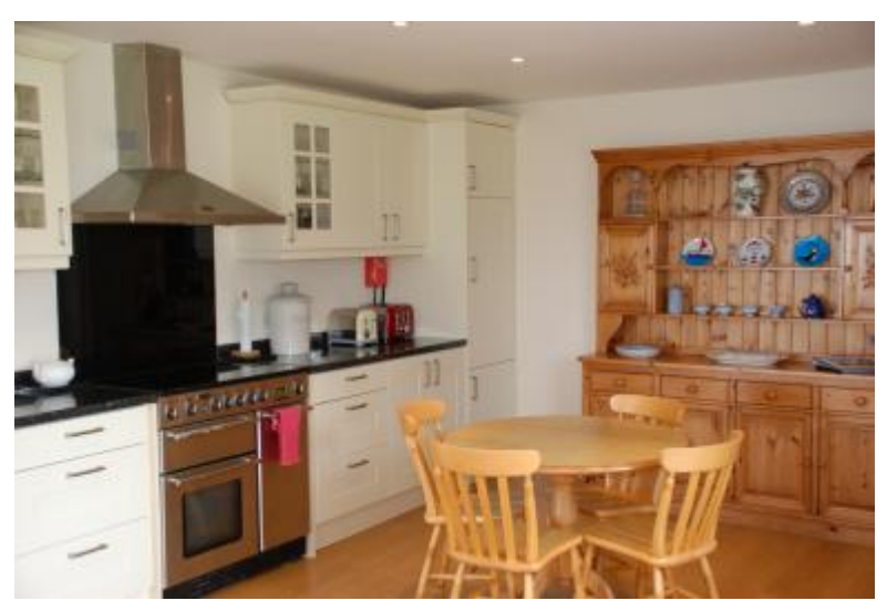
Chy Carn kitchen