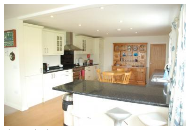
Chy Carn kitchen